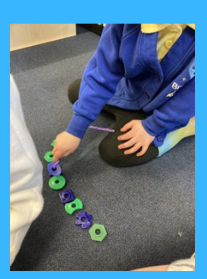
Nursery have absolutely blown us away with their pattern work this week!